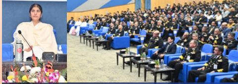
Session by BK Shivani for Senior Leadership & Staff at NHQ as part of 60-Day Resilience Prog of Navy on 07 Jan 25