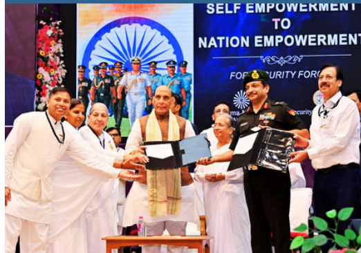
MoU signed between the ECHS & SSW and also Launching of Nationwide “Mental Wellness” Campaign for Security Personnel by Shri Rajnath Singh Ji, Hon’ble Defence Minister at BK HQ, Abu on 21 April 25