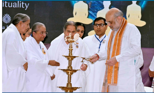
Union Home Minister Shri Amit Shah inaugurates SSW Silver Jubilee program on ‘Self-Empowerment through Inner Awakening’ for security forces personnel at BK HQ, Abu, Rajasthan on 17 April 25